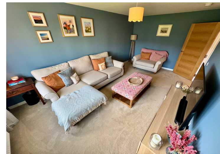
Colville Crescent, Glengarnock