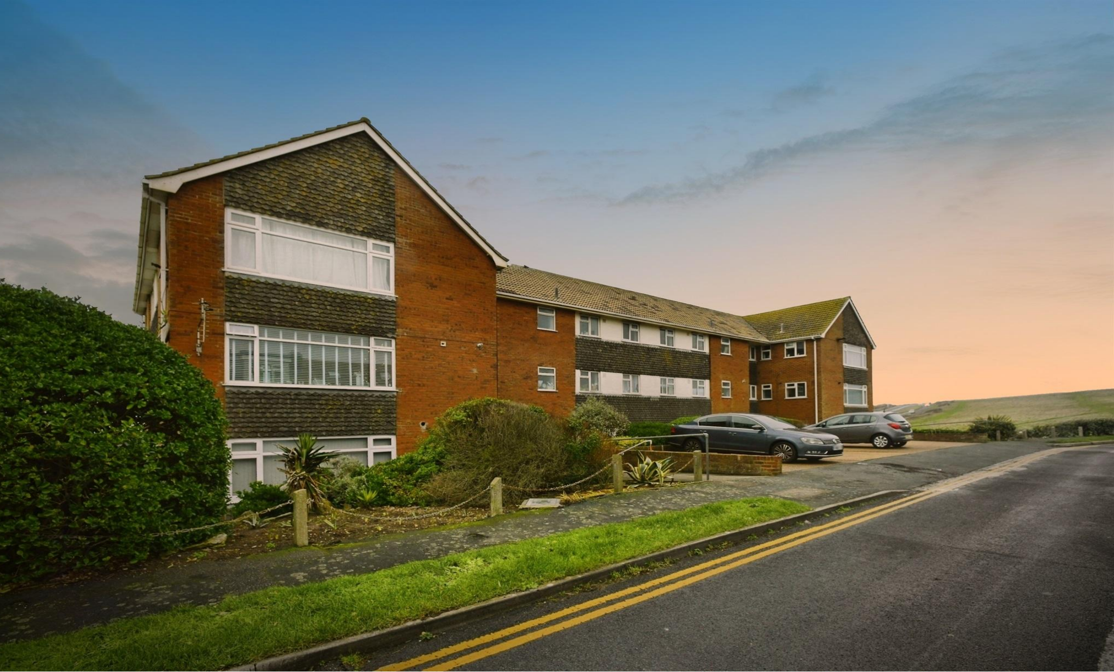
Gorham Court Gorham Way, Telscombe Cliffs Peacehaven BN10 7BB