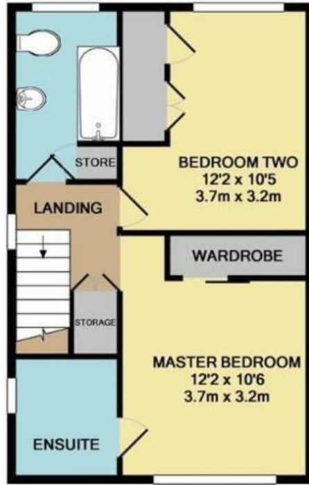
1ST FLOOR APPROX. FLOOR AREA 430 SQ.FT. (39.9 SQ.M.)