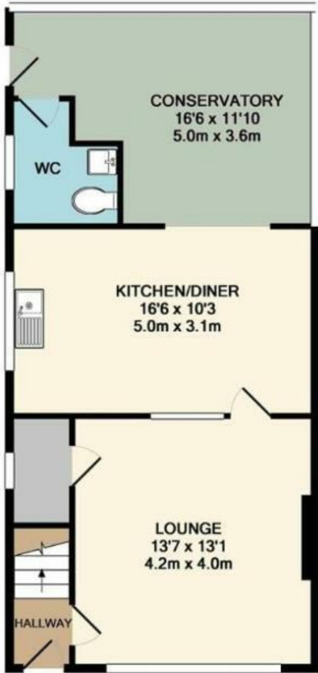
GROUND FLOOR APPROX. FLOOR AREA 584 SQ.FT. (54.3 SQ.M.)