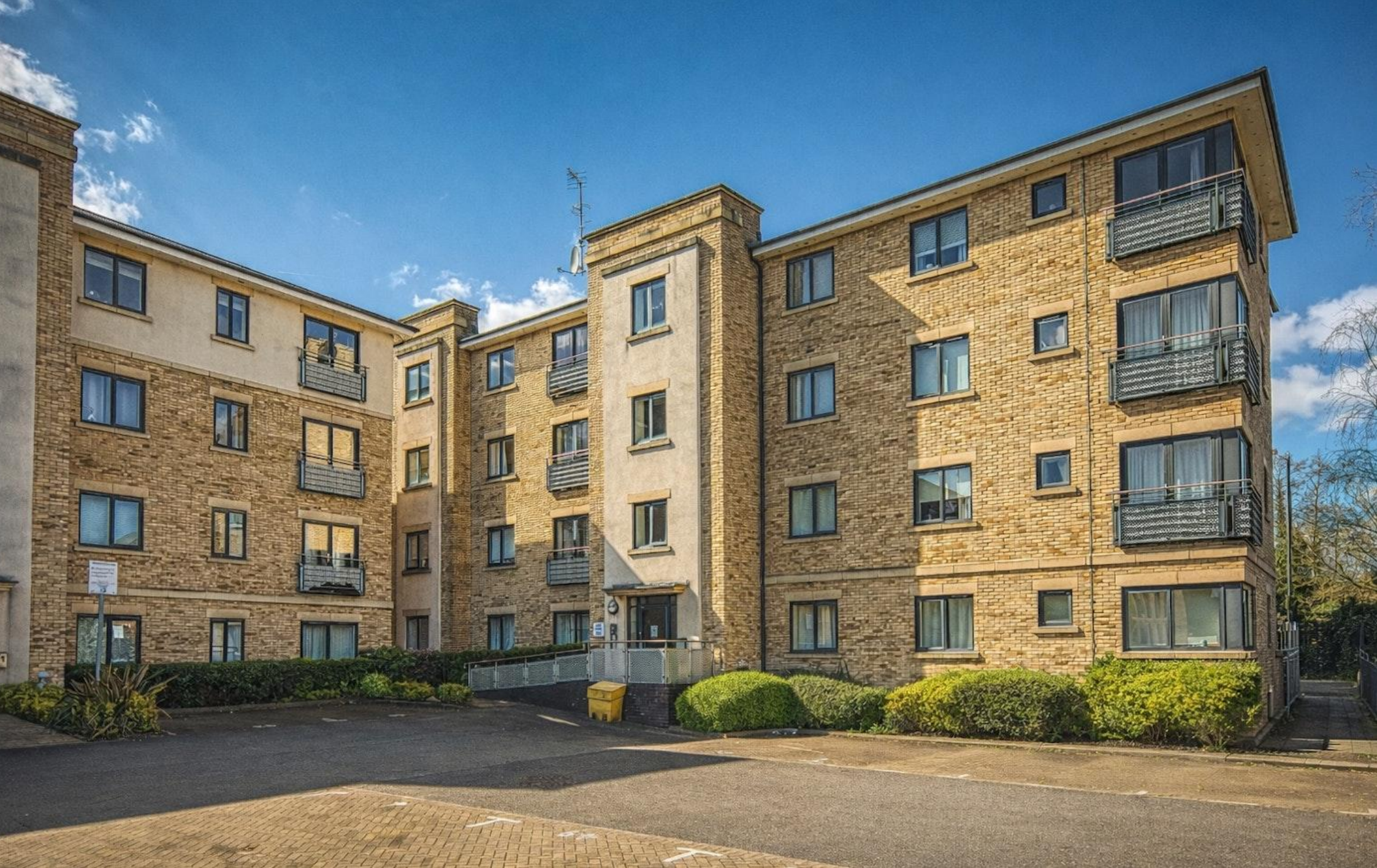
Searl Street , City Centre, Derby