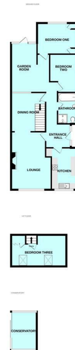
Made with Mergin 3D205