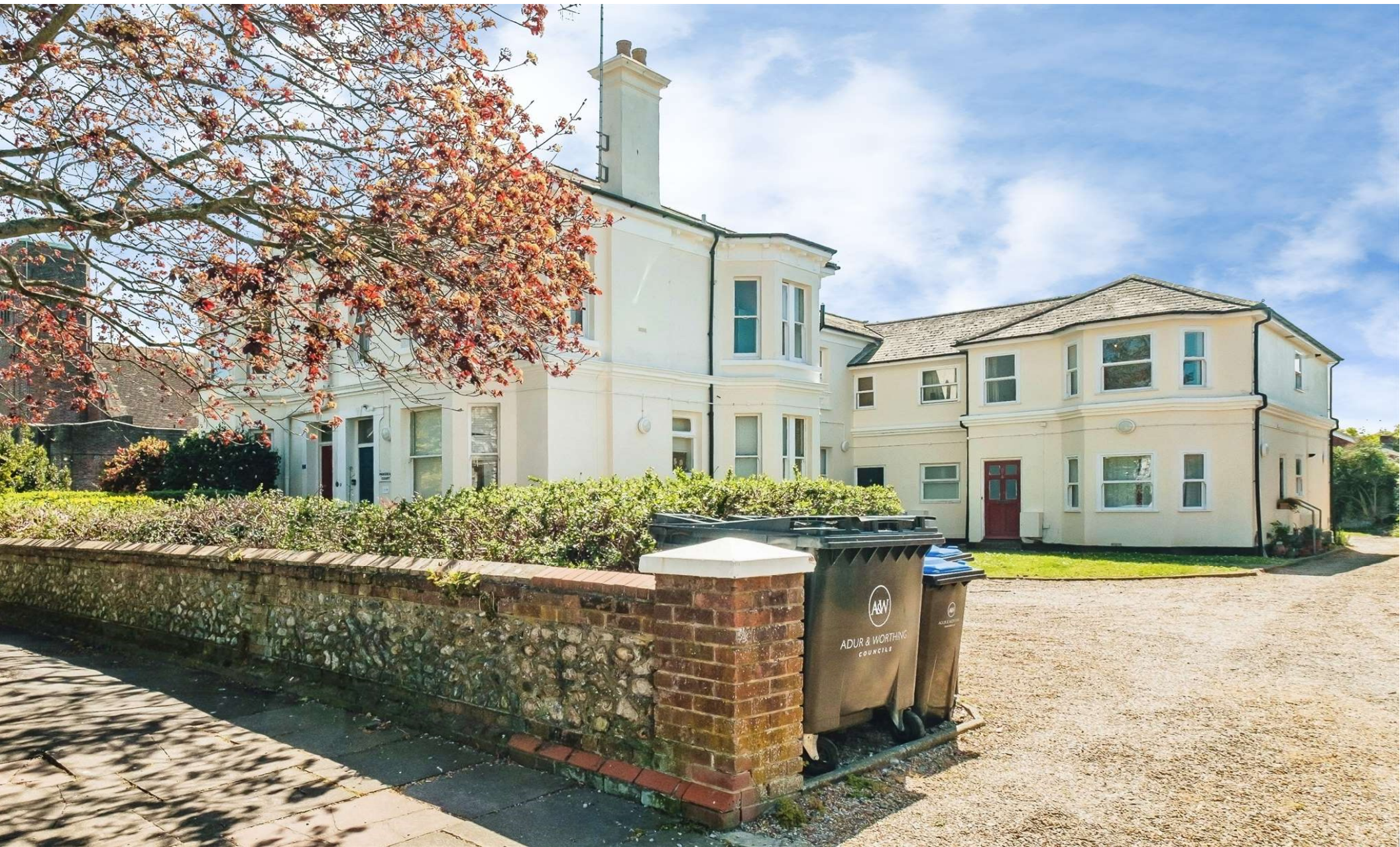
Pangdean Court St. Michaels Road, Sussex Worthing BN11 4SD