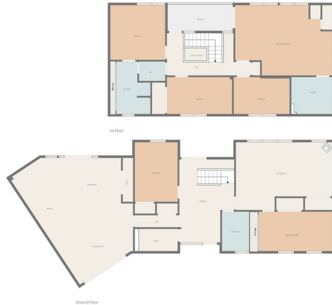
Floor Plan Created By Cubicasa App. Measurements Deemed Highly Reliable But Not Guaranteed.