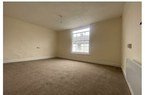
Combe House Fore Street, Chulmleigh, EX18 7BR Price Guide £200,000