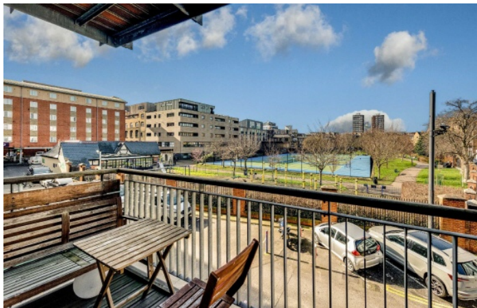
Tanner Street, SE1