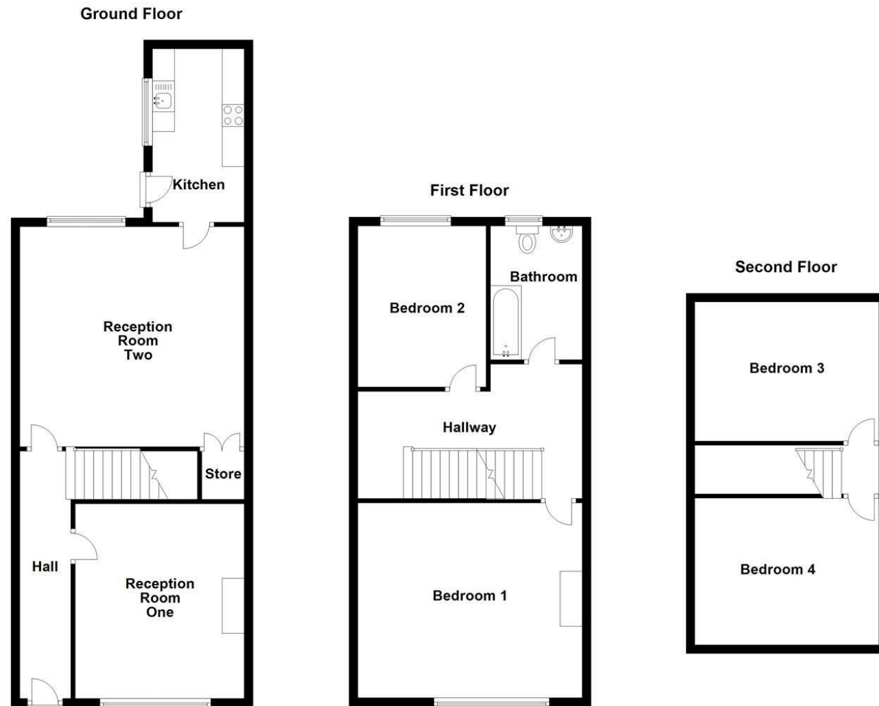
All floorplans are for guidance only. Not to scale. Please check all dimensions and shapes before making any decisions reliant upon them. Plan produced using PlanUp.