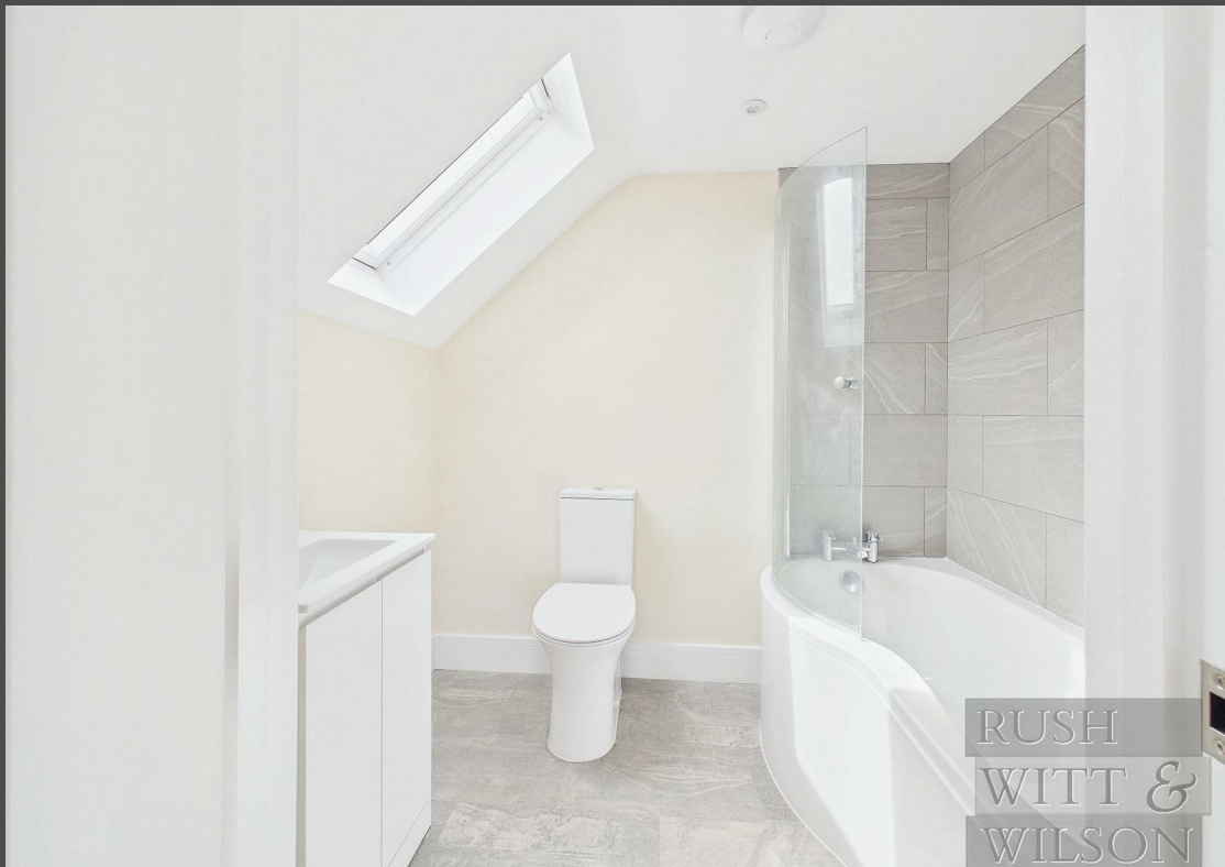
RUSH WITT & WILSON