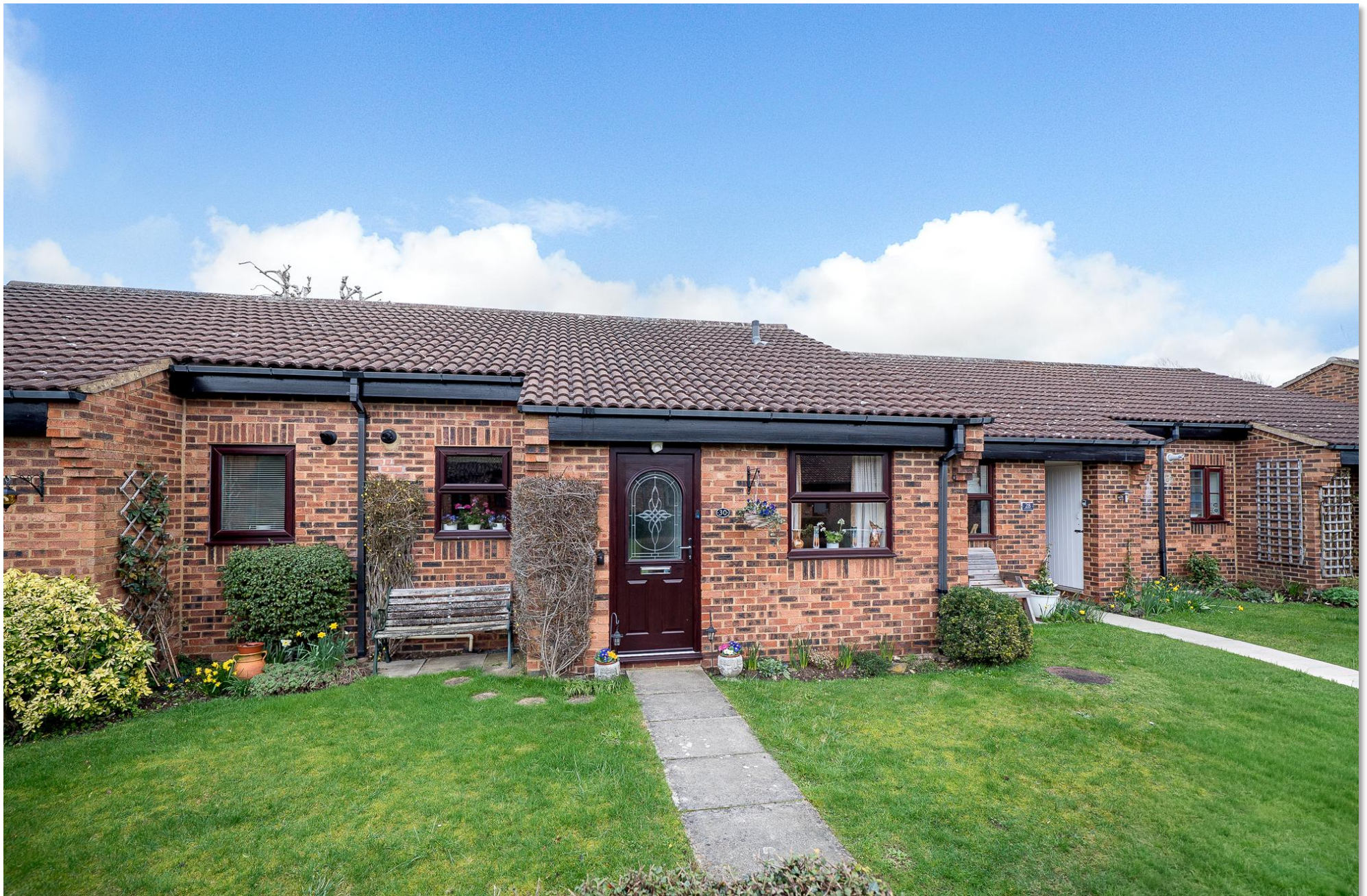
Mandelyns, Northchurch Berkhamsted HP4 3XH