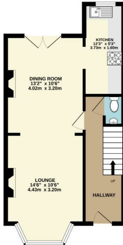
GROUND FLOOR 426 sq.ft. (39.6 sq.m.) approx.