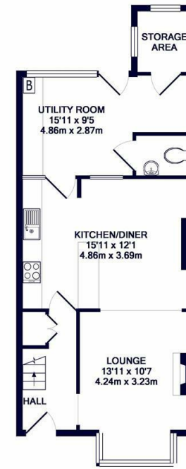
GROUND FLOOR APPROX. FLOOR AREA 566 SQ.FT. (62.5 SQ.M.)