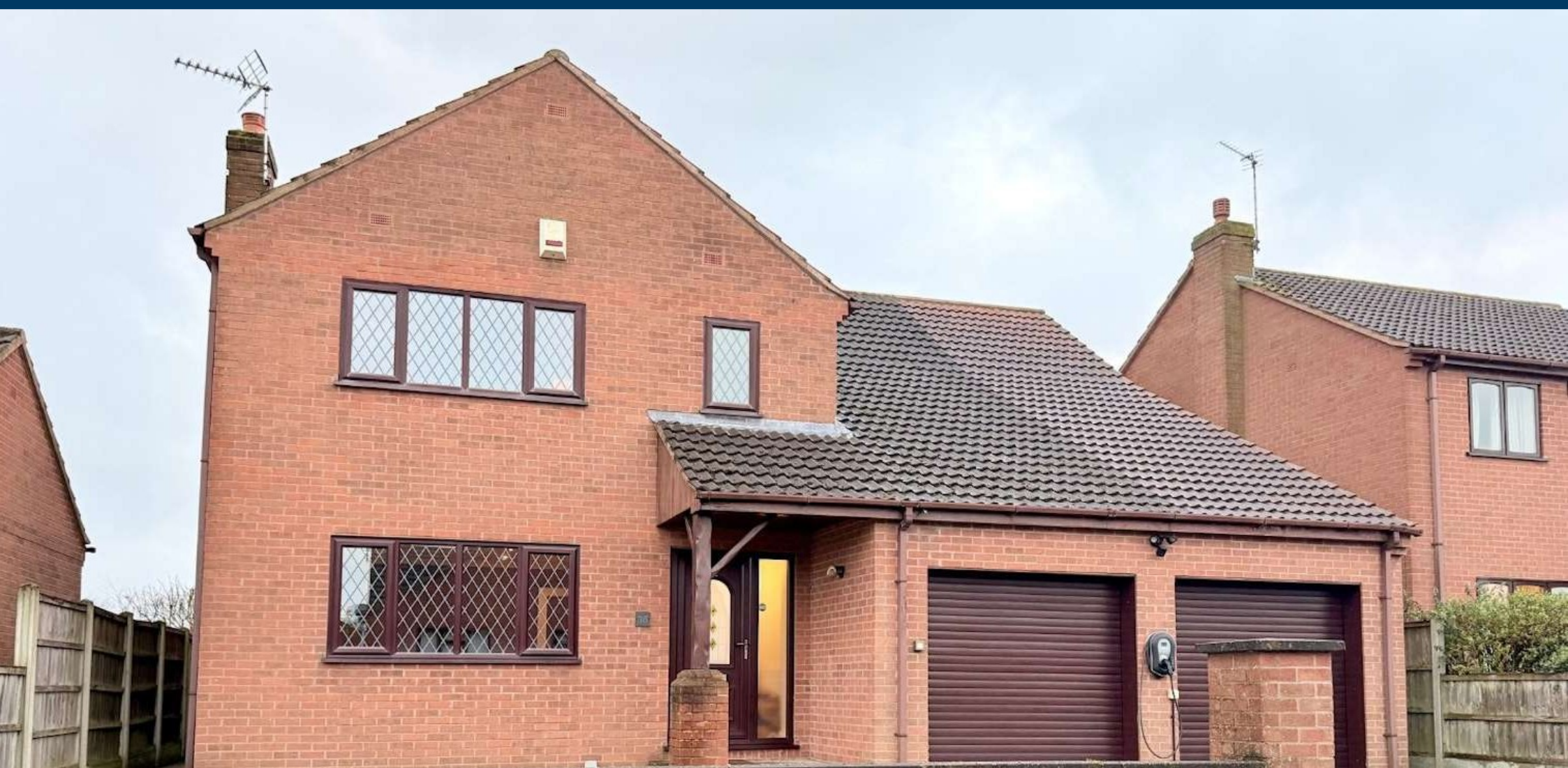
The Hemplands, Collingham