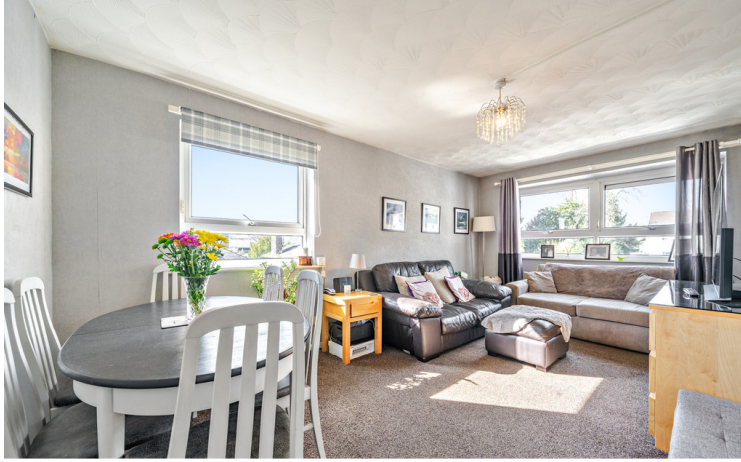
Open Plan lounge/dining room