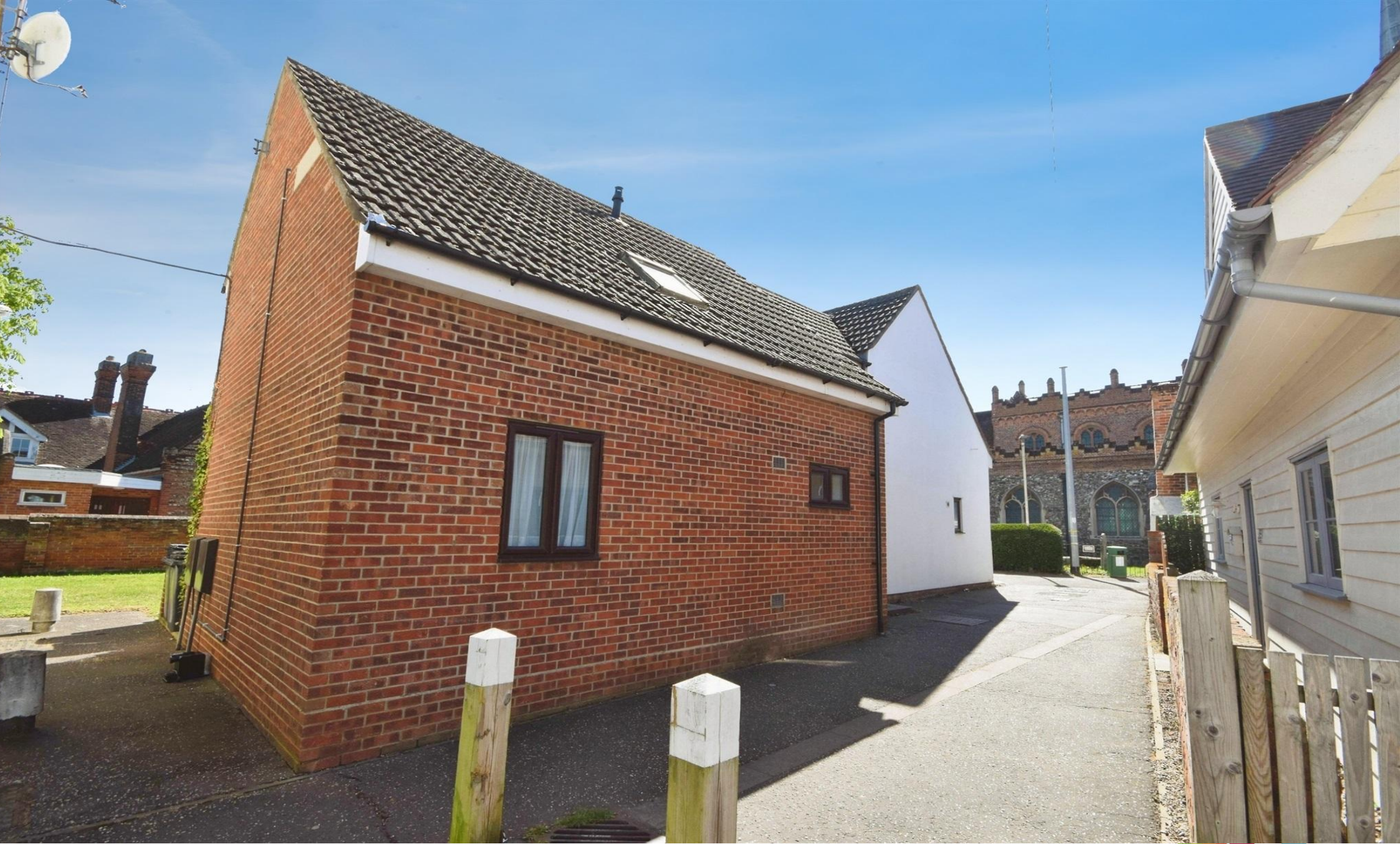
The Chase, Great Baddow Chelmsford CM2 7JU