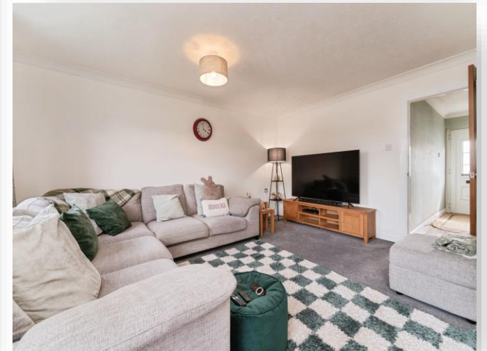
Victoria Street, Littleport CB6 1NA