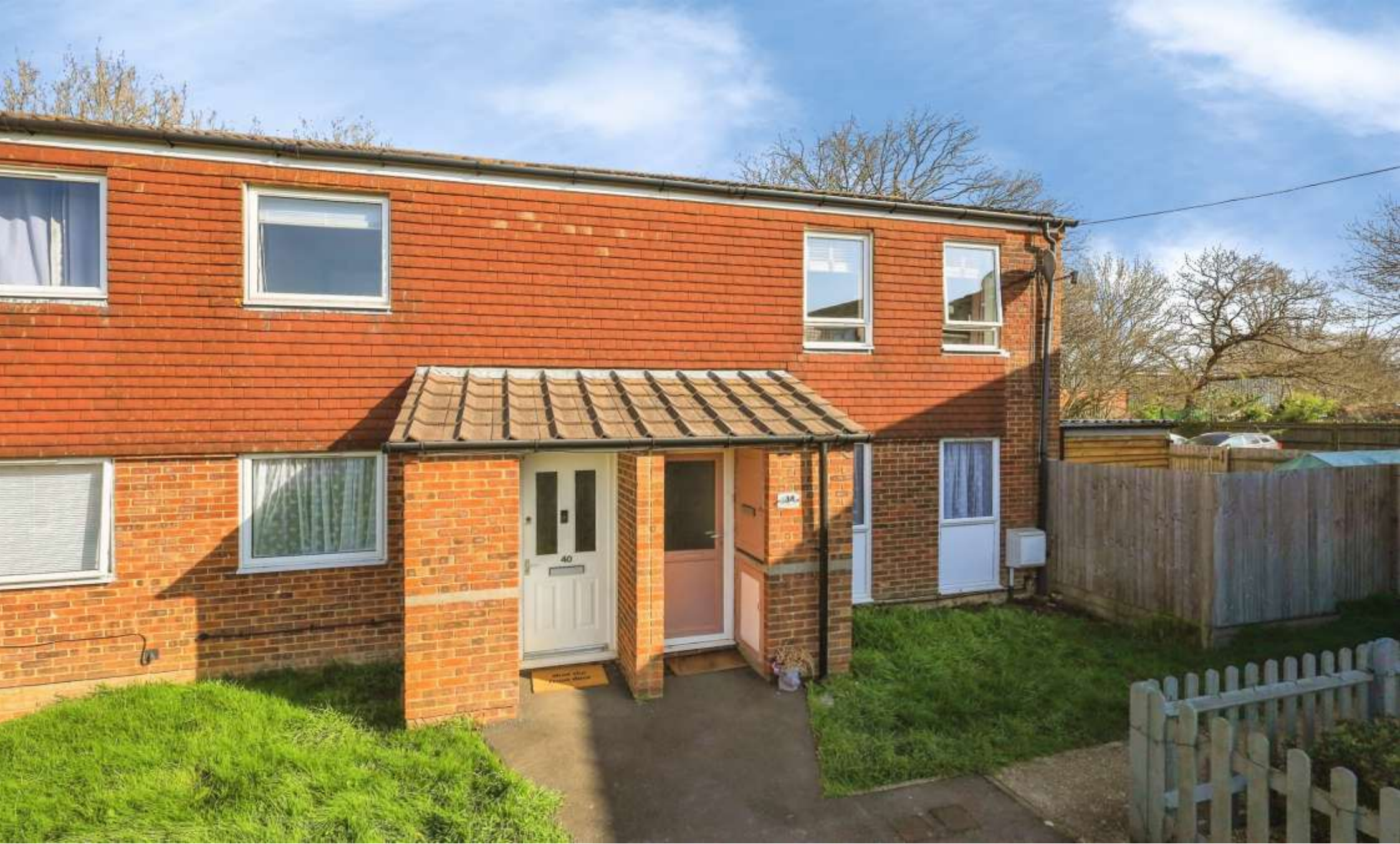
The Holt, Hailsham BN27 3ND