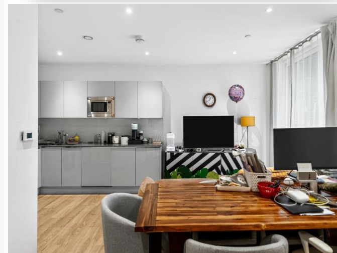
Millwards Court, Greyhound Parade, London SW17 0JQ