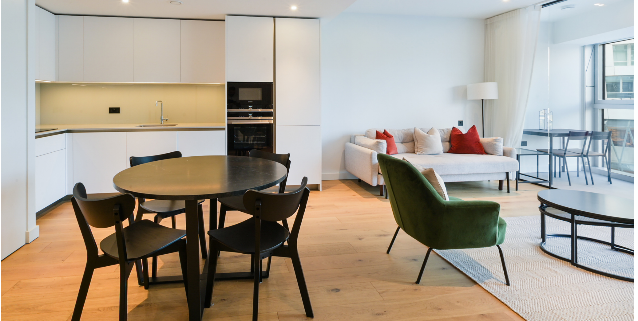
KOA HOUSE, Battersea SW11