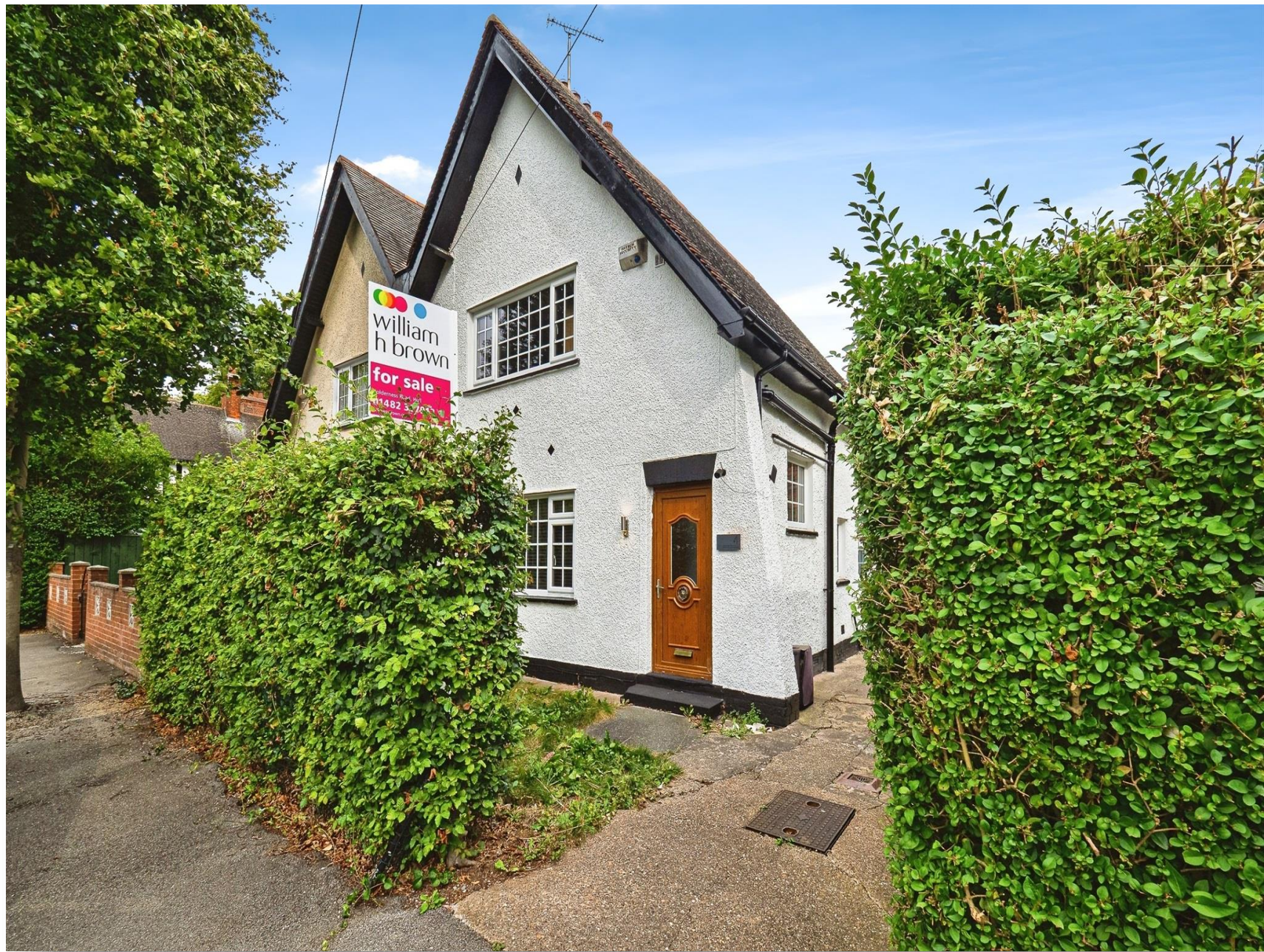
Beech Avenue, Garden Village, Hull, HU8 8QH