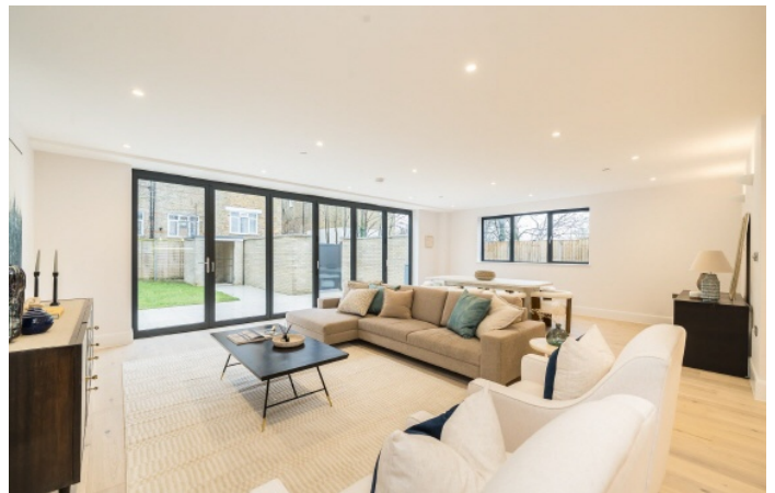
Mount Ephraim Road, SW16