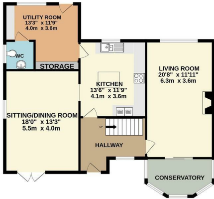
GROUND FLOOR 961 sq.ft. (89.3 sq.m.) approx.