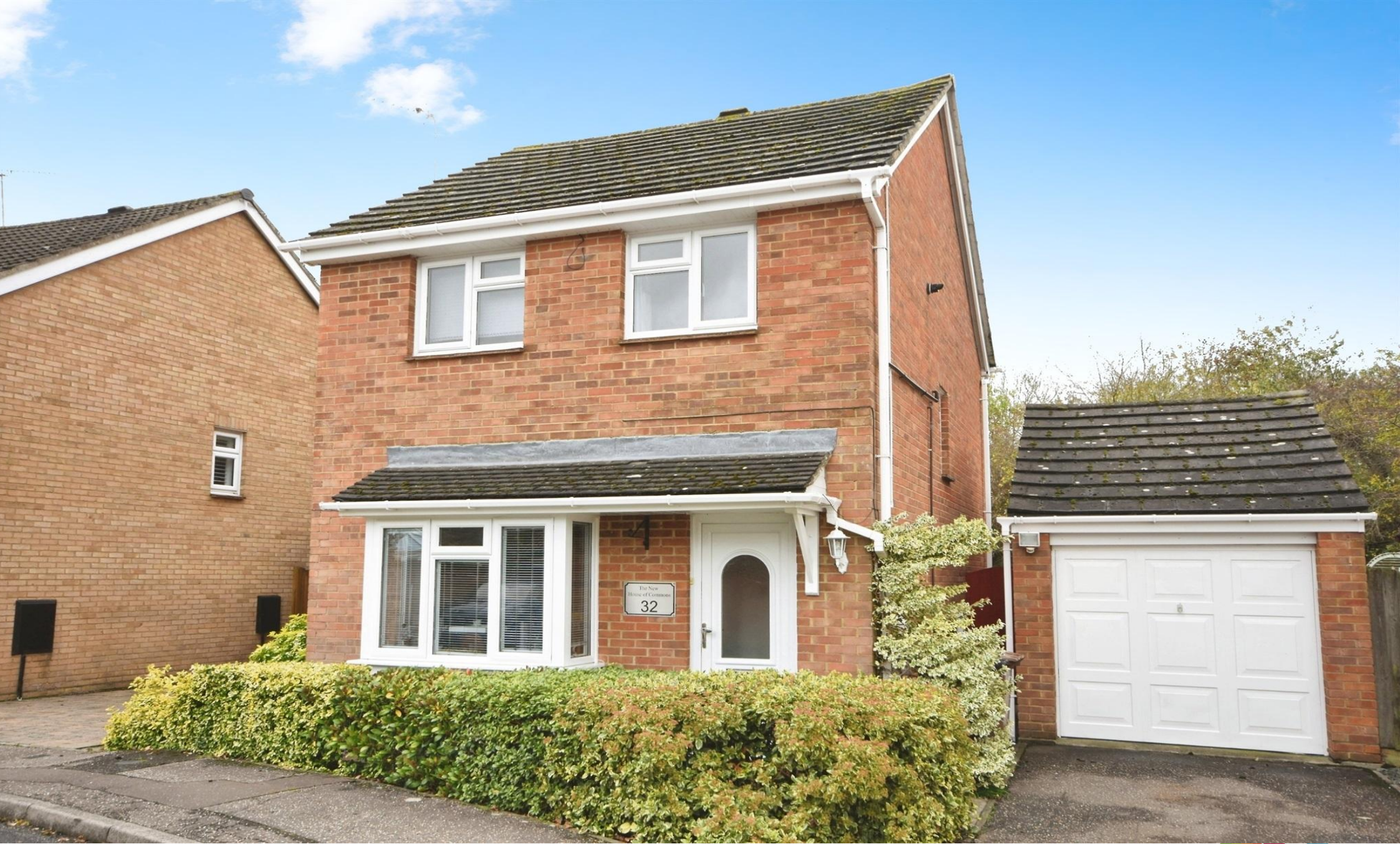
Flintwich Manor, Chelmsford CM1 4YP