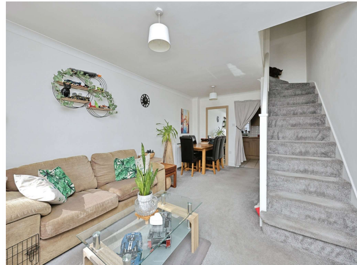
Manor Close, Hockering, Dereham, NR20 3HU