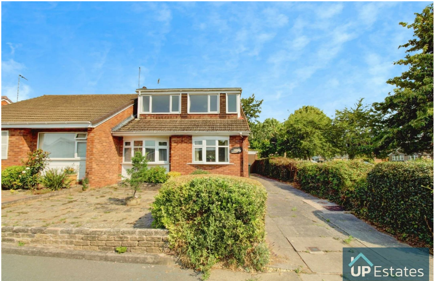
Hexworthy Avenue, Coventry