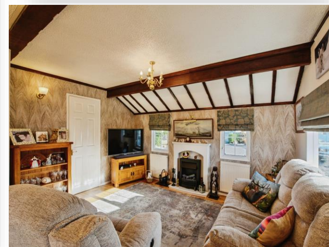
Kingfisher Drive Beacon Park Home Village, Skegness PE25 1TG