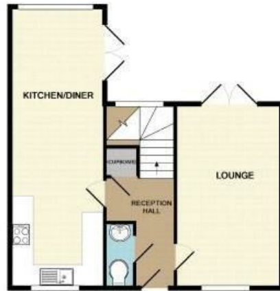
GROUND FLOOR APPROX. FLOOR AREA 624 SQ. FT. (58.0 SQ. M.)

**PERFECT FOR SHARERS ** Looking for a spacious property, combine your budget and you could be living in this beautiful property. Ideal for sharers with 2 ensuite bedrooms and a further 2 double bedrooms as guest rooms or study/gaming rooms. Pets by Neg. Available NOW.