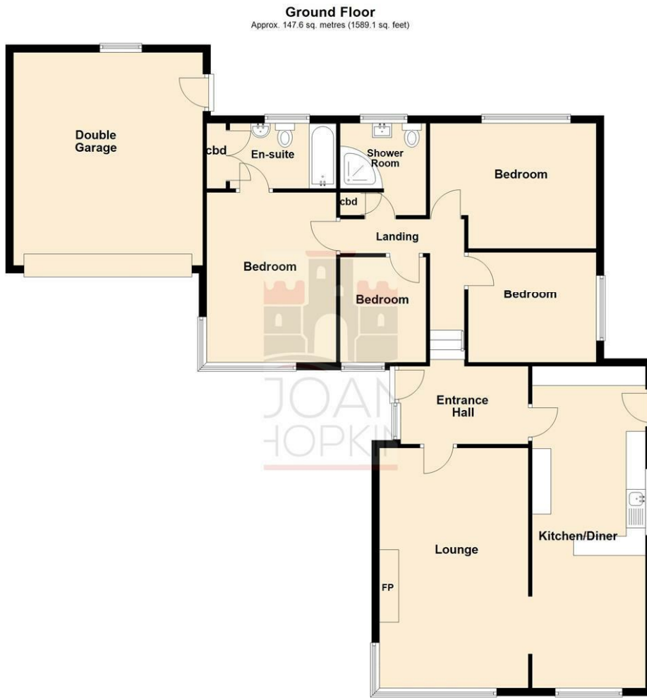
Total area: approx. 147.6 sq. metres (1589.1 sq. feet)