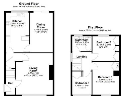
Total area: approx. 93.1 sq. metres (1001.7 sq. feet)