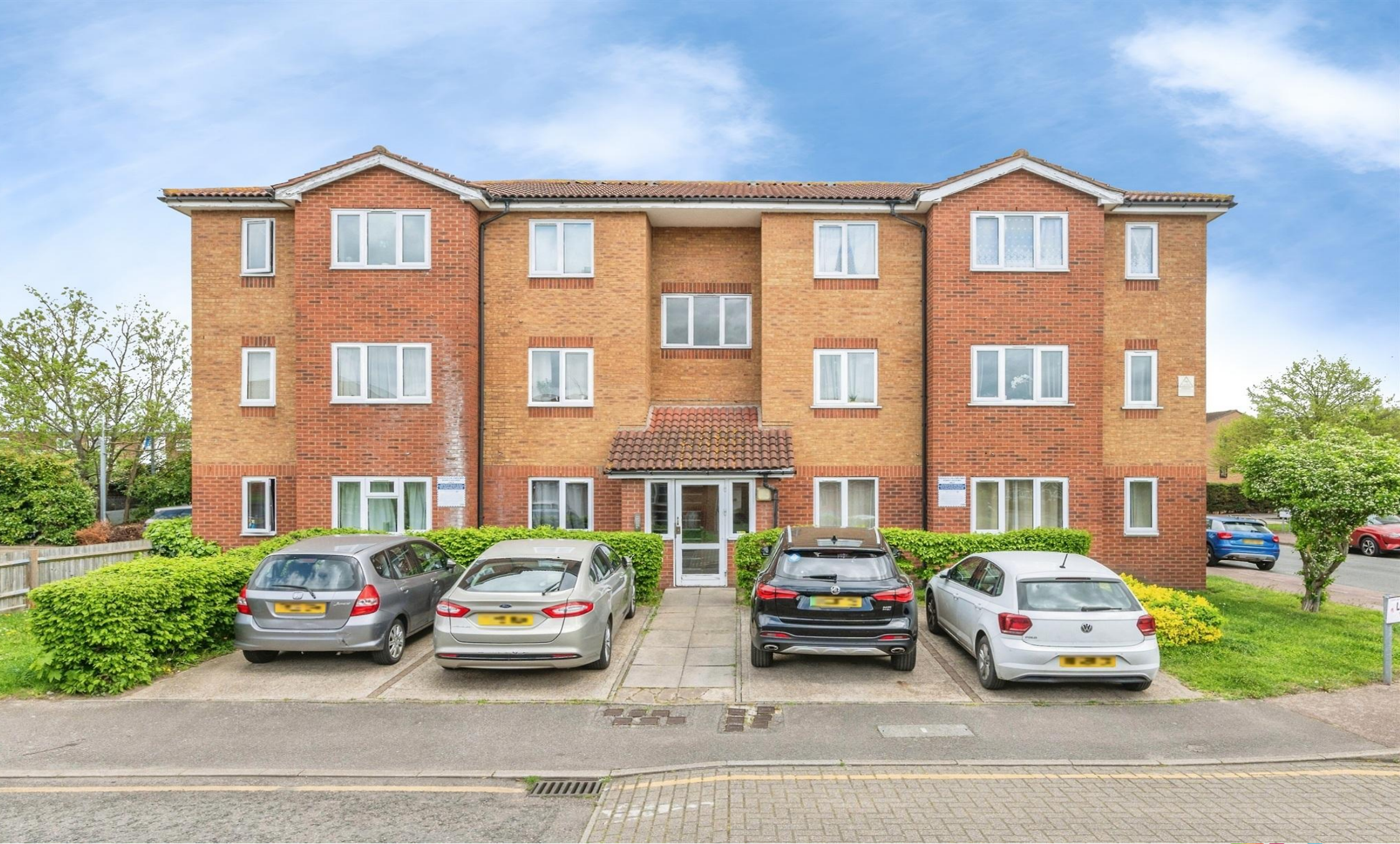
Rounders Court, Lewis Way, Dagenham, RM10 8UW