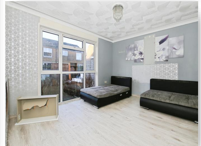
Eldern, Orton Malborne Peterborough PE2 5NG