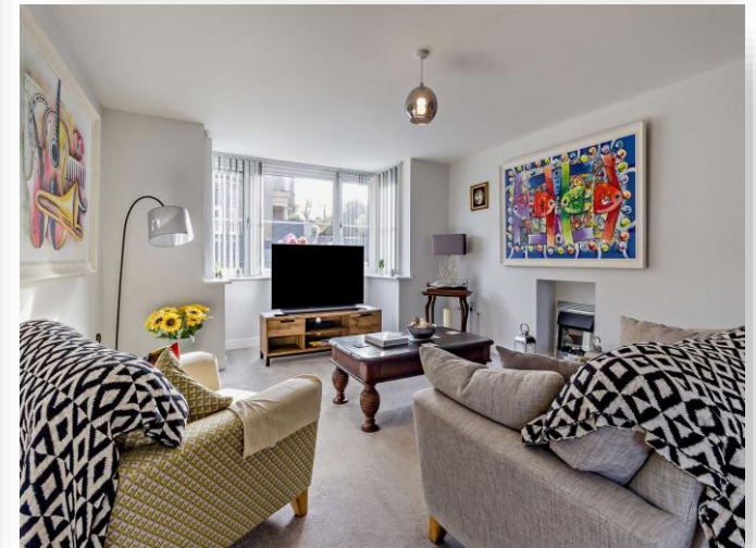
Birch House Heather Close, Moorgate Rotherham S60 2TQ