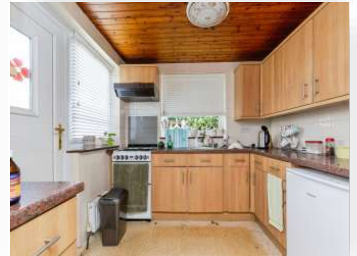
Spalding Road, Hartlepool TS25 2JP