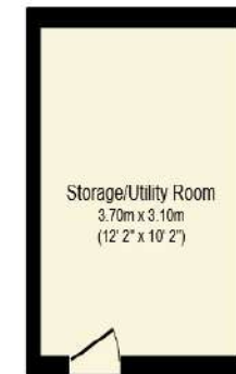
Outbuilding Floor area 11.5 sq.m. (123 sq.ft.)

Total floor area: 96.0 sq.m. (1,034 sq.ft.)