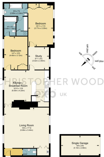
8 SHARDLOES, HP7 APPROX. GROSS INTERNAL FLOOR AREA 1510.60 SQ FT / 140.34 SQ M. INC. GARAGE OTHERWISE, THE BASES IN LISTS ARE NOT TO SCALE. COPYRIGHT © THE BENCH MARK LTD 2008

03032026_1441 Energy performance certificate (EPC) - Find an energy certificate - GOV.UK