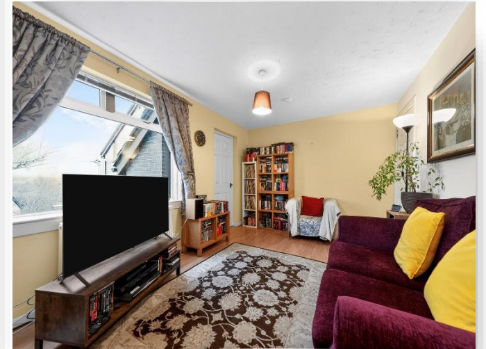
Kirkton Road, Cambuslang Glasgow G72 8LF