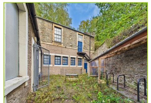
The Old Police Station, Jacobs Wells Road, Cliftonwood, Bristol, BS8 1DR