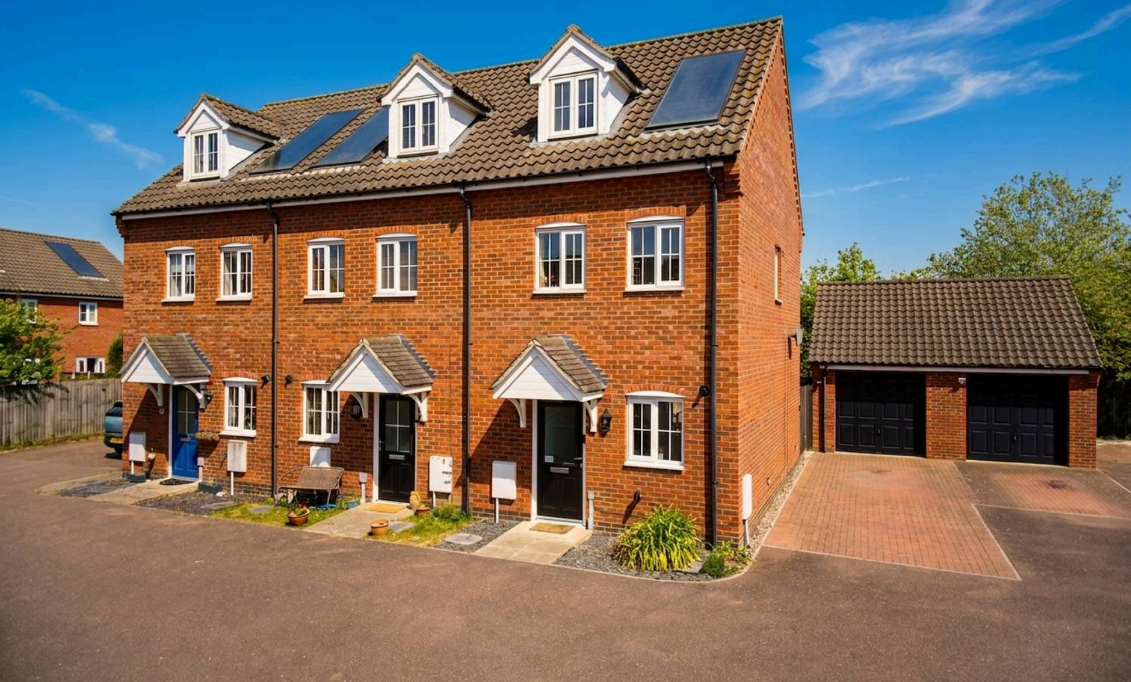
Carpenter Close, Wymondham - NR18 0WG