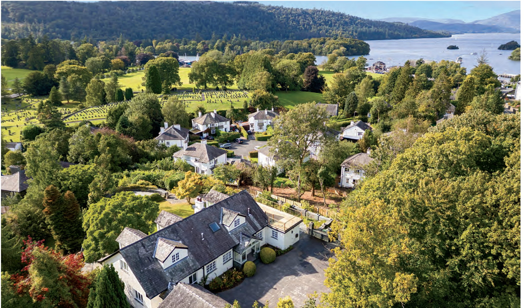
Birkett Hill House Bowness-on-Windermere | The Lake District | LA23 3EZ