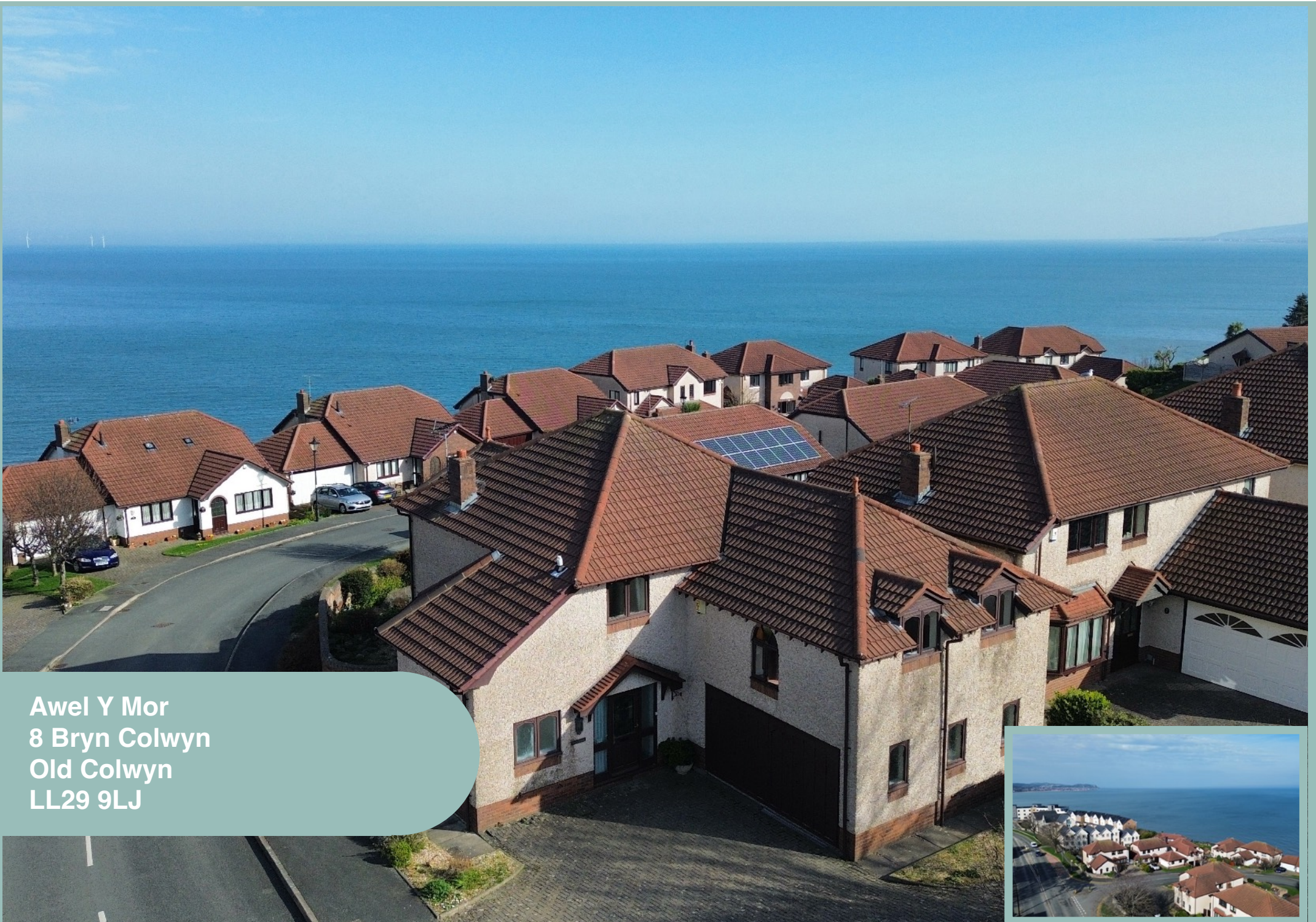
Awel Y Mor 8 Bryn Colwyn Old Colwyn LL29 9LJ