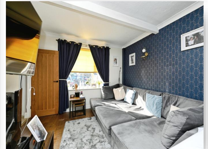
Churchfield Road, Outwell, WISBECH, PE14 8RL