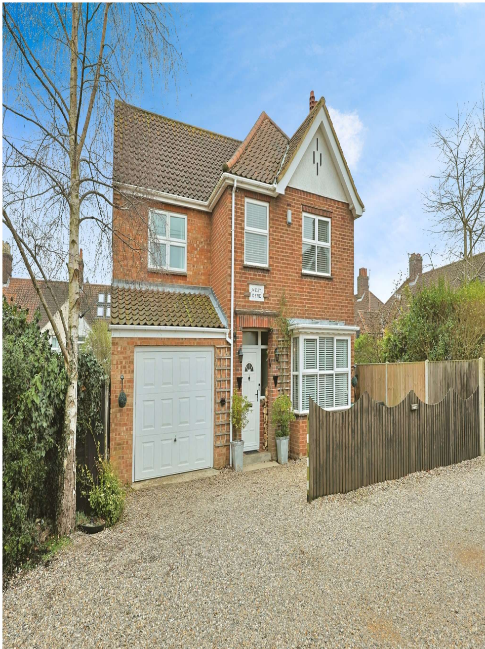
Westdene, Park Road, Dereham, NR19 2BT