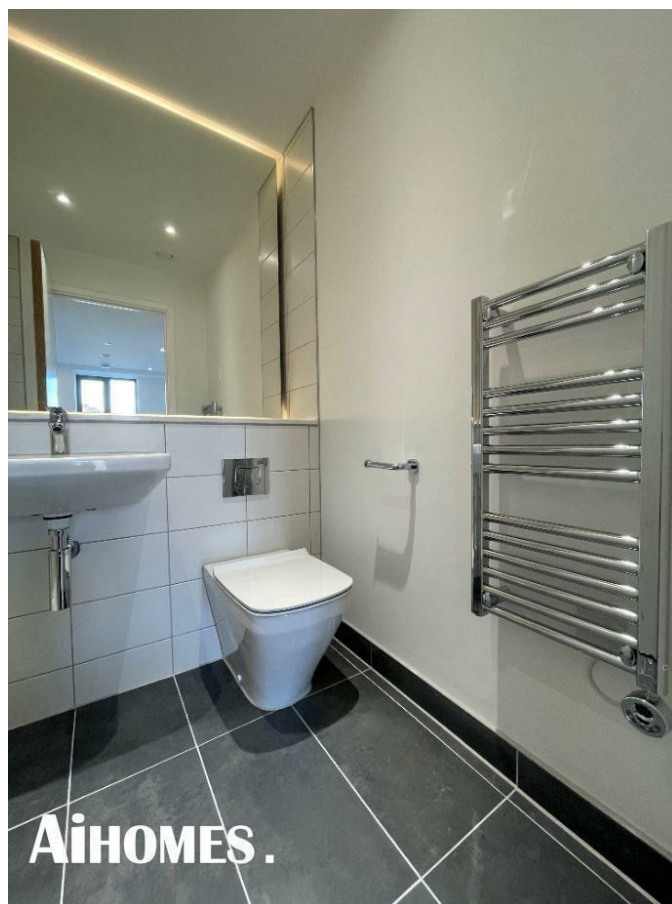
Modern 2-Bed Apartment | Local Crescent | C37595LC