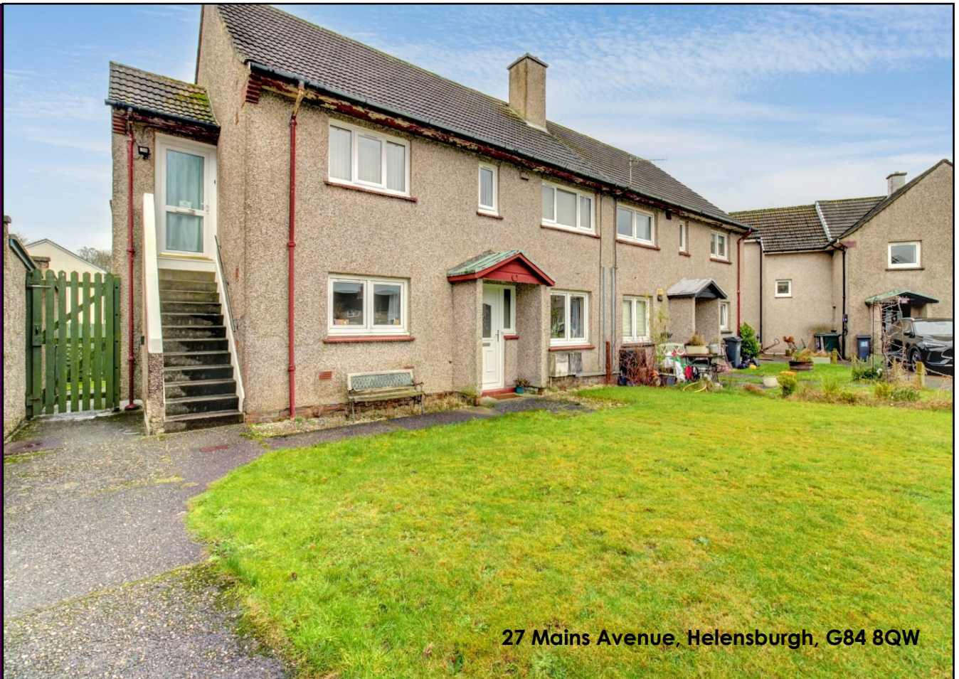
27 Mains Avenue, Helensburgh, G84 8QW

Set in a peaceful position on the west side of town, this bright and spacious 2 bedroom lower cottage flat enjoys an enviable location just a short distance from Helensburgh's vibrant town centre, where an excellent range of shops, cafés, restaurants and everyday amenities can be found.