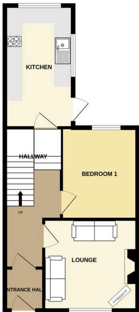
GROUND FLOOR 538 sq.ft. (49.9 sq.m.) approx.