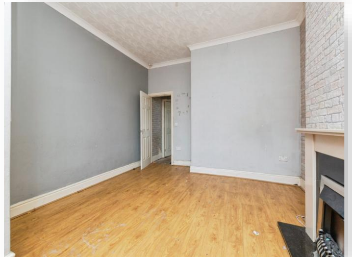
Harcourt Street, Hartlepool, TS26 8LN