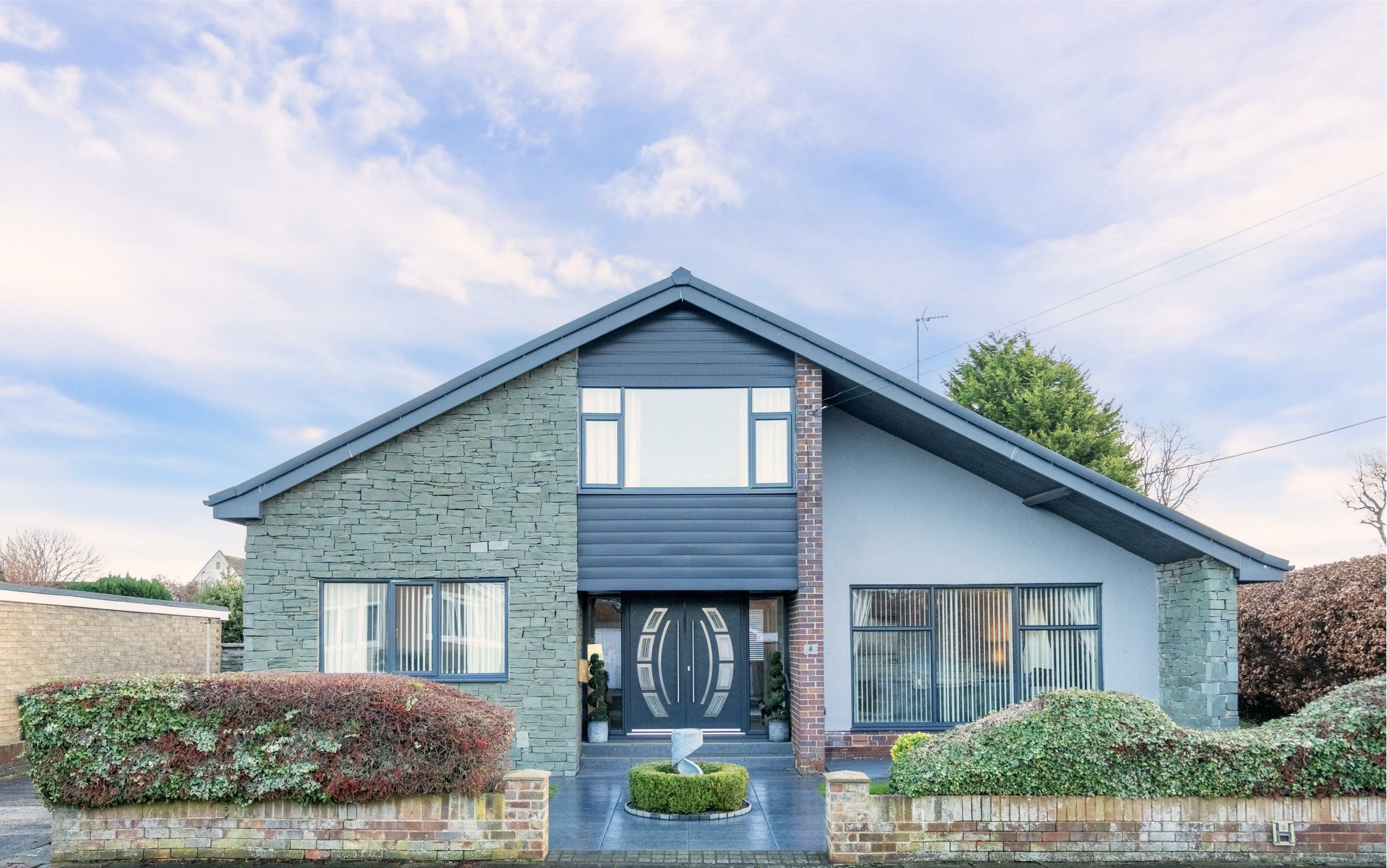
📍 North Farm Estate, Nedderton Village NE22 6AY