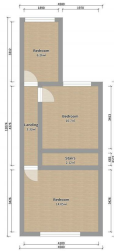
Milner Road First Floor